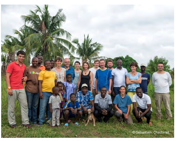
Team at the Savè supersite

During the two months of measurements, 15 intensive observation periods (IOPs) were performed: 3 before, 5 after and 7 during the aircraft campaign, which was scheduled in the middle of the ground campaign (12 June to 30 July 2016). In order to plan and coordinate an IOP at the three supersites, Skype conferences took place every day. A weather forecast and an overview of the performance of the instruments were prerequisites for the IOP decision making. On IOP days, normal radiosondes, as well as frequent radiosondes were launched and remotely piloted aircraft systems (RPAS) were additionally operated in intervals of 1.5-3 hours for 24 hour periods - hard work for all of the staff members. For collection of the frequent radiosondes, local personal was employed - also a difficult task taking into account that the environment was often characterized by impassable areas with bushes and trees. Nevertheless, the measurements proceeded without severe complications or difficulties, data lacks were small and the collected data set provides comprehensive information about the atmospheric conditions - even some unexpected phenomena (Instrument availability table: http://dacciwa.sedoo.fr/source/monitoring.php? current=20161116&nav=Monitoring).