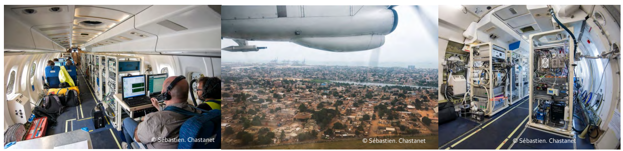
Left: SAFIRE ATR scientist during research flight, middle: city of Lomé from aircraft, right: instrumentation inside the aircraft

Stratus clouds, (ii) Land-sea breeze clouds, (iii) Biogenic emission, (iv) Megacities emission (v) Flaring emission and (vi) Dust and biomass burning aerosol. The focuses of the 3 EUFAR projects were: (i) Ship tracks in the Gulf of Guinea, (ii) Mid-level clouds over Benin and (iii) Low-