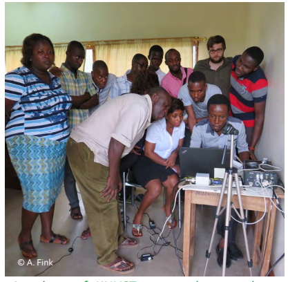
A cohort of KNUST meteorology students went on an internship to GMET Headquarters and took part in DACCIWA soundings