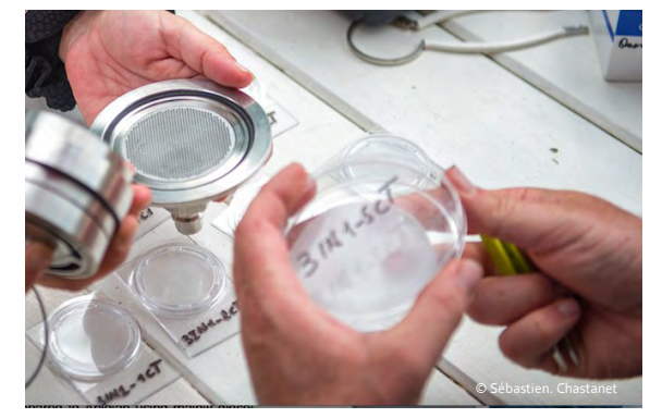
Filters with aerosol impactors

(1) to calculate in situ dose-inflammatory response ratios for each studied source. Air pollution experiments include three impactors running in parallel three times in each campaign in the same conditions, in order to determine aerosol chemical composition and their pro-oxidant capacity by size as well as in vitro inflammatory biomarkers to derive inflammatory response. As an example, the picture below shows collection of filters after sampling and more specially the black-coloured filter linked to ultra fine size collection.