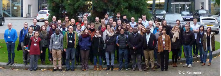
Participants of the DACCIWA project meeting in Leeds November 2016

A list with foreseen publications was elabo-