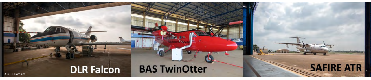
Aircrafts for the DACCIWA campaign in Lomé, Togo

The main objective for the aircraft detachment was to build robust statistics of cloud properties in Southern West Africa in different chemical landscapes: from the background state over the Gulf of Guinea (marine aerosols or mix between marine aerosols and biomass burning aerosols) to ship/flaring emissions to the coastal