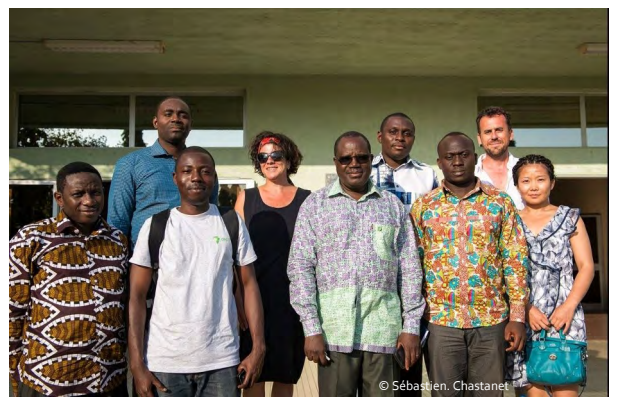
WP2 Team in Cotonou

In parallel to these intensive measurements, long-term experiments were also active during the july 2016 campaign including on the four sites: air pollution measurements with weekly aerosol collection for PM2.5 mass, black carbon and organic carbon, pro-oxydant aerosol capacity, bimonthly gas collection for ozone, nitrogen dioxide, ammonia, nitric acid and sulphur dioxide and aerosol optical depths (AOD) and epidemiological survey with census of hospital admission for respiratory diseases and morbidity at the hospital or health centers close to our four experimental sites.