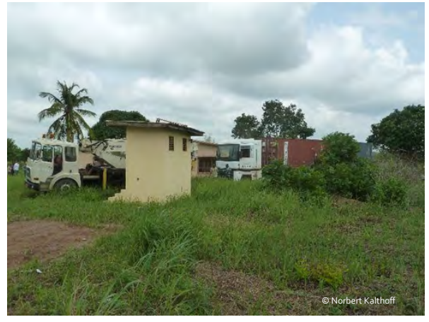
Trucks with measurement equipment arriving at the Savè supersite

In June and July 2016 three supersites Savè (Benin), Kumasi (Ghana) and Ile-Ife (Nigeria) were installed to investigate the processes which determine the development and dissolution of the low-level clouds. These clouds cover a large area and exist for a large part of the night as well as during the morning in those months.