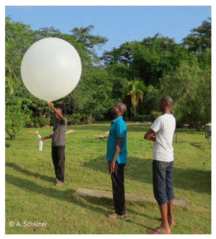
Radiosonde launch at Lamto (Côte d'ivoire)

Within the DACCIWA campaign, some 750 extra meteorological sondes have been released into the West African sky in June-July 2016. Not only have these sondes provided temperature, humidity, wind, and pressure measurements every second from the ground to altitudes of 20 km to the DACCIWA research data base, but coarser resolved vertical profiles of these variables were successfully submitted in real time to the weather forecasting centres worldwide. This success story would not have been possible without the grand support of African Weather Services, African academic colleagues, and students from Europe and Africa.